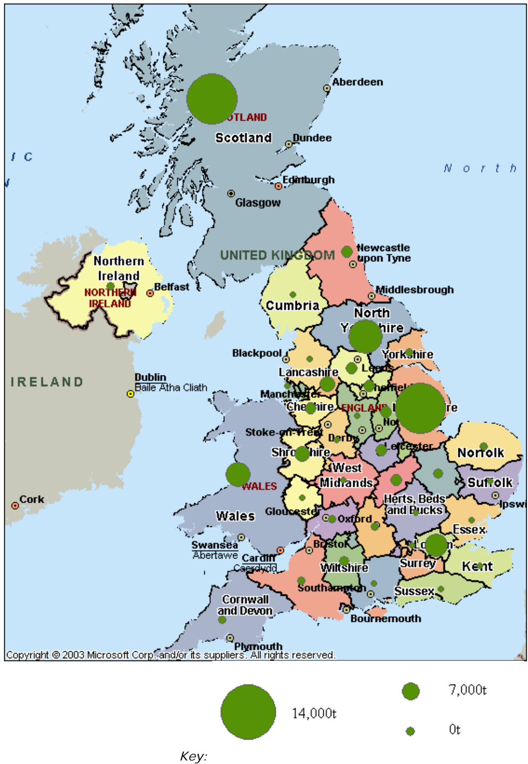
Fig. 2: Tonnage of waste sent to landfill, by area, in 2006