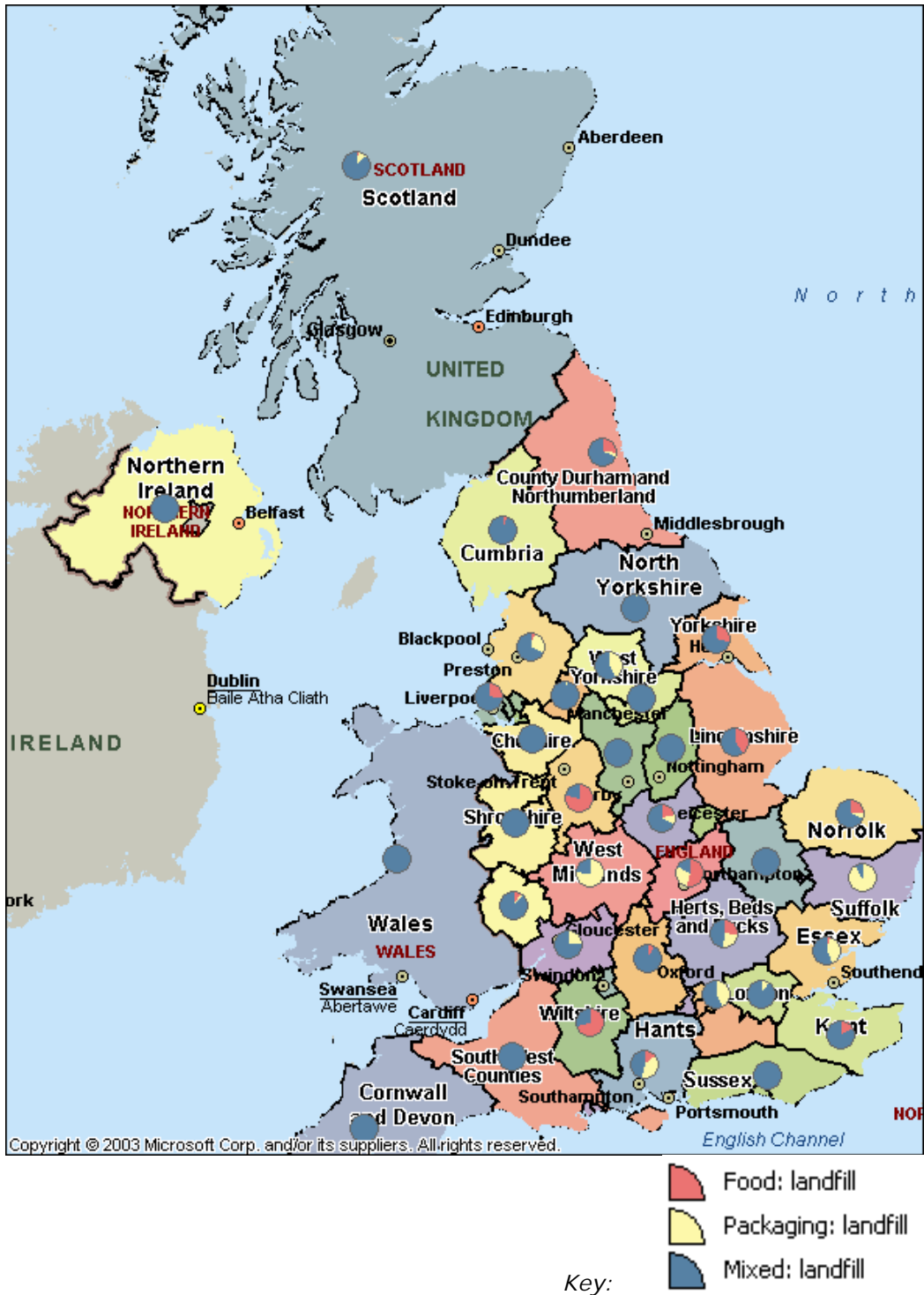
Fig. 3: Breakdown of landfill waste by type, by area, in 2006