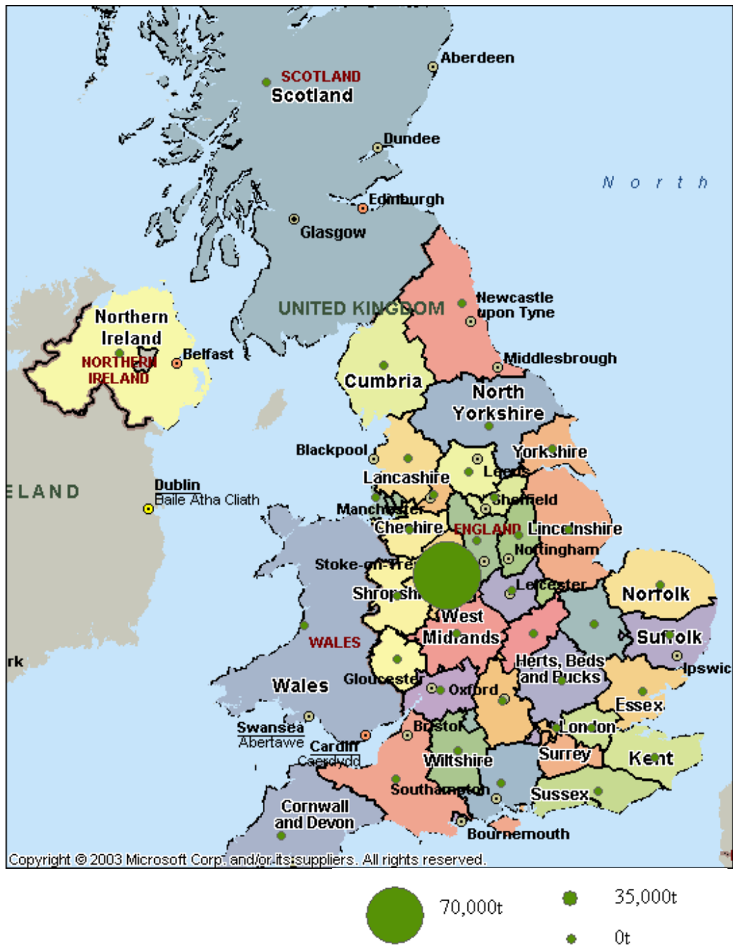
Fig. 4: Tonnage of food waste sent to anaerobic digestion plants, by area, in 2006