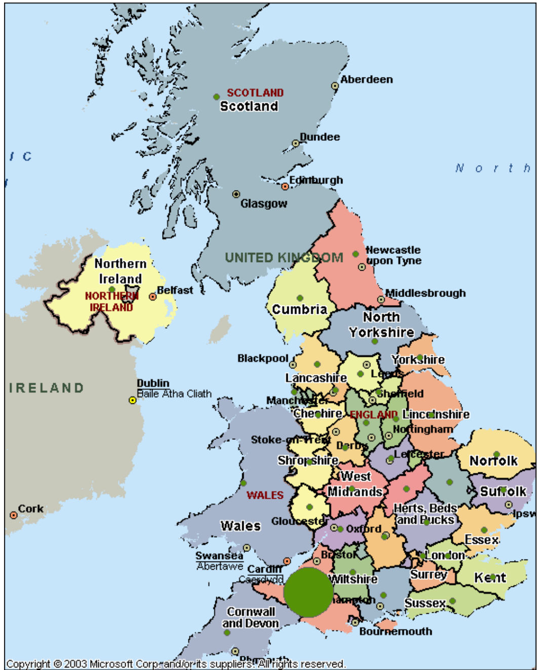
Fig. 6: Total waste sent to thermal treatment, by area, in 2006