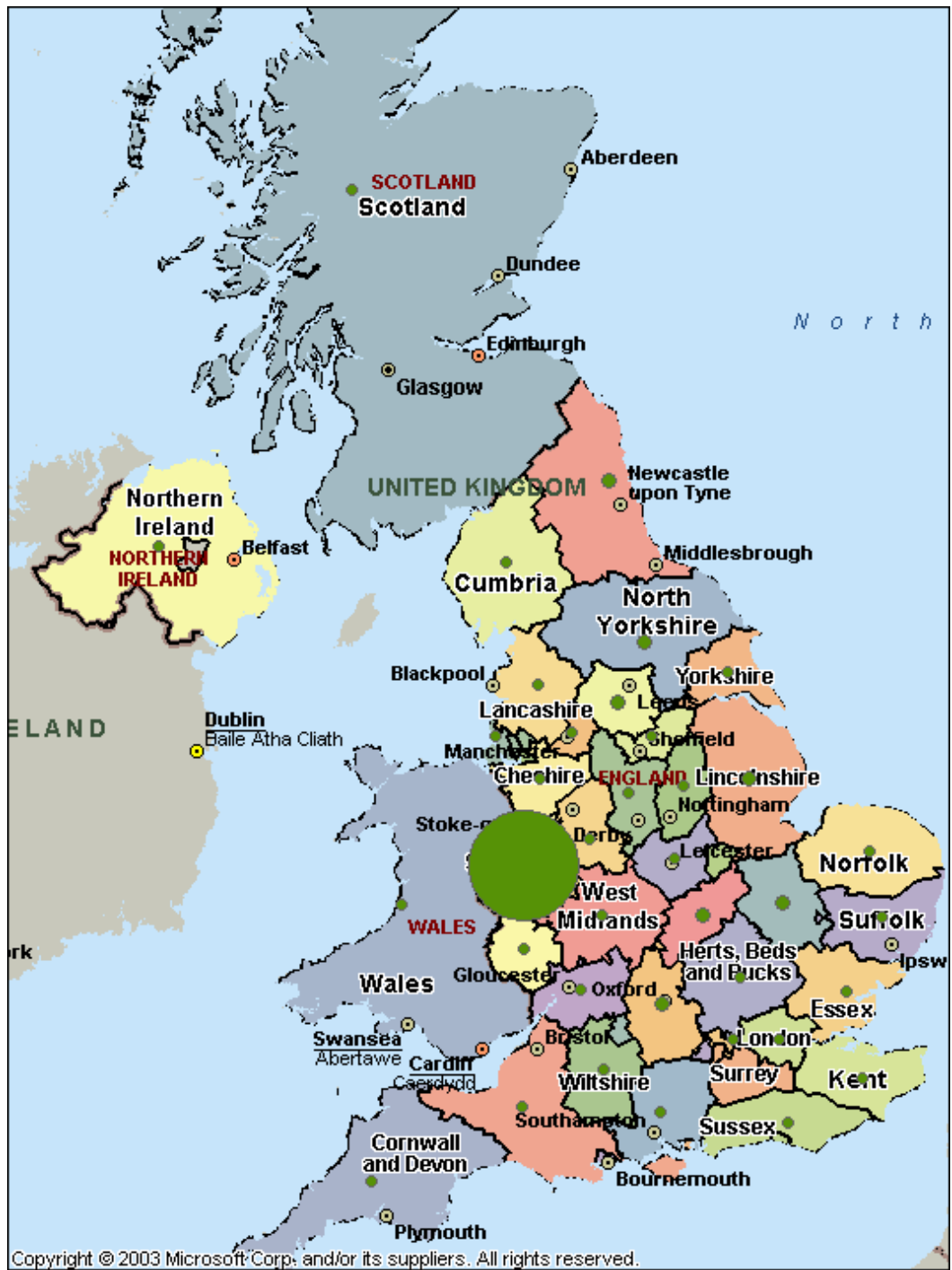
Fig. 5: Waste sent to landspreading, by area, in 2006