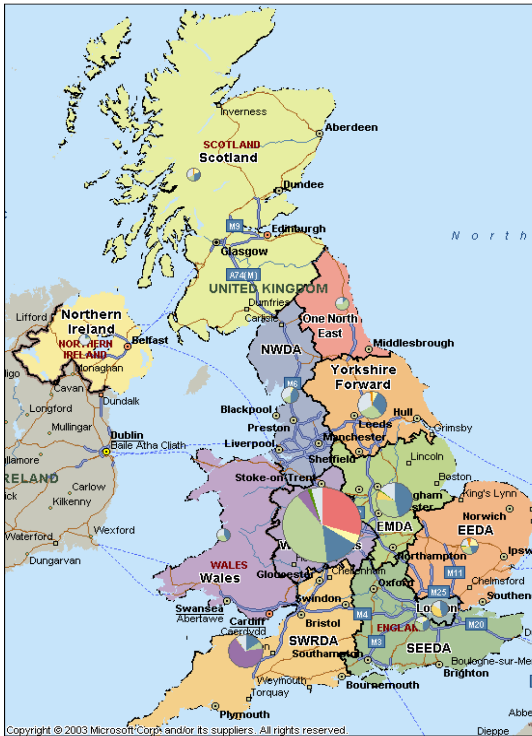
Fig 9: Waste by disposal/recovery route, by RDA/country, in 2006