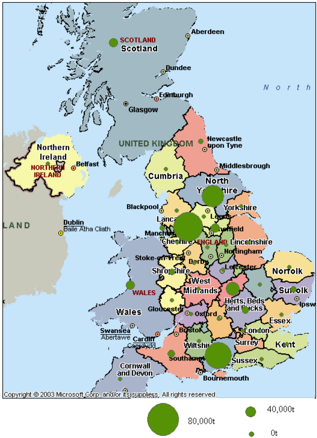
Fig. 10: By-products produced, by area, in 2006

Copyright © 2003 Microsoft Corp. and/or its suppliers. All rights reserved.