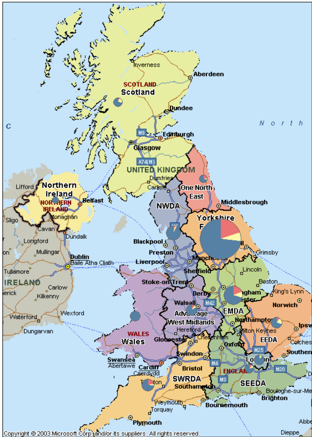
Fig 8: Breakdown of landfill waste-type and quantity, by RDA/Country, in 2006