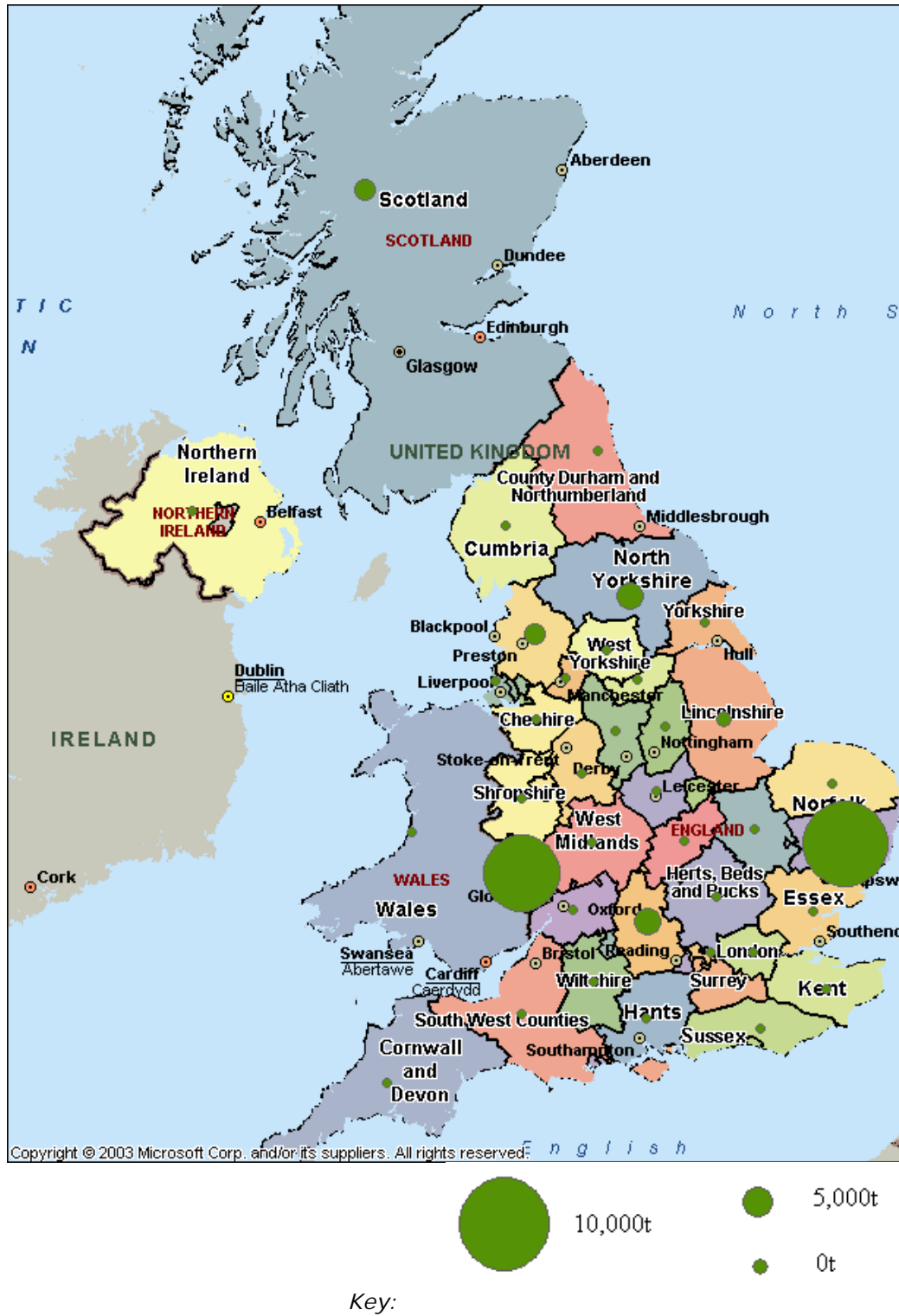
Fig. 7: Tonnage of waste composted, by area, in 2006