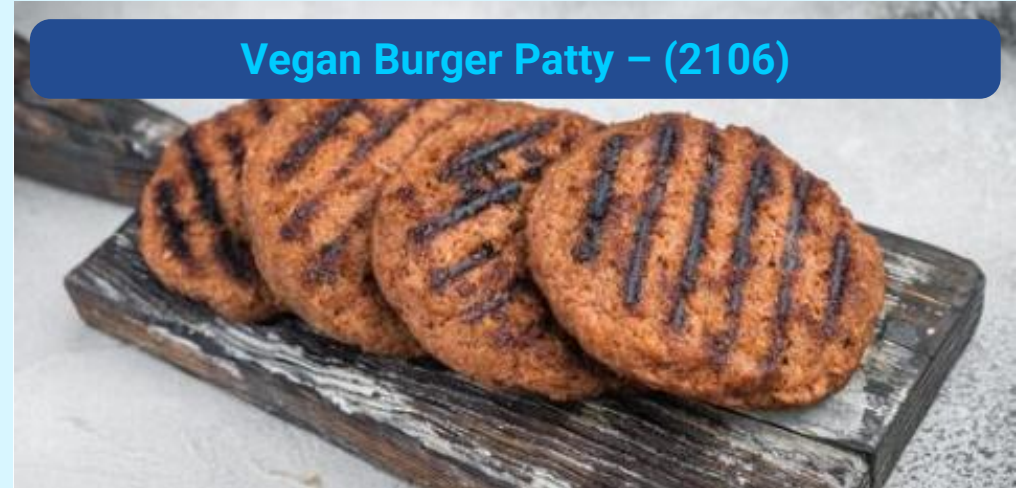
Vegan Burger Patty – (2106)