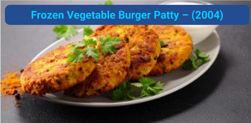
Frozen Vegetable Burger Patty – (2004)

The product: A Frozen Vegan Burger Patty